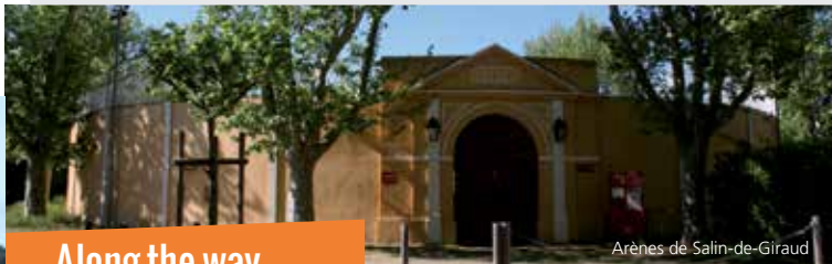
Arènes de Salin-de-Giraud

The Rhone River has been crossed at Salin-de-Giraud since 1933. The first ferry was powered by a windlass, but was destroyed during WWII. A new diesel ferry was introduced in 1955. In 1957 a railway ferry was added for transporting salt. The fourth Barcarin ferry (Bac de Barcarin) was inaugurated in 1987 and the fifth in 2012. These are the ferries used today to cross the river from one bank to the other.