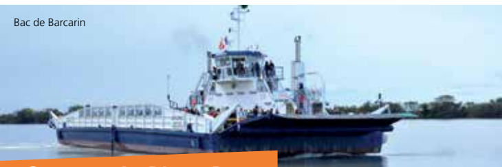
Bac de Barcarin